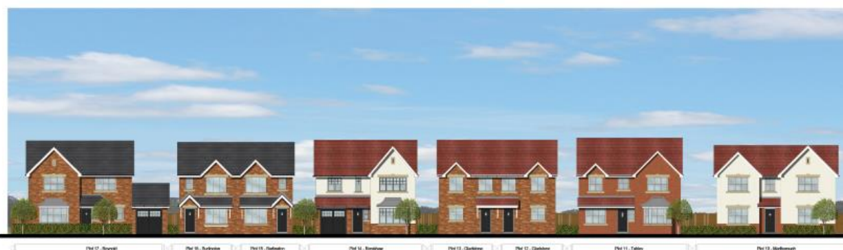
SECTION B - B